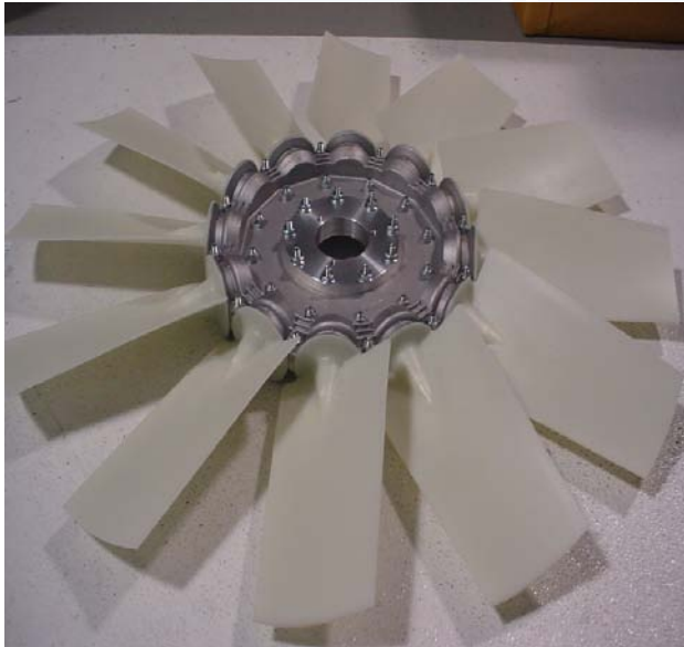
HASCON 12-WAY WITH SDS TAPERLOC