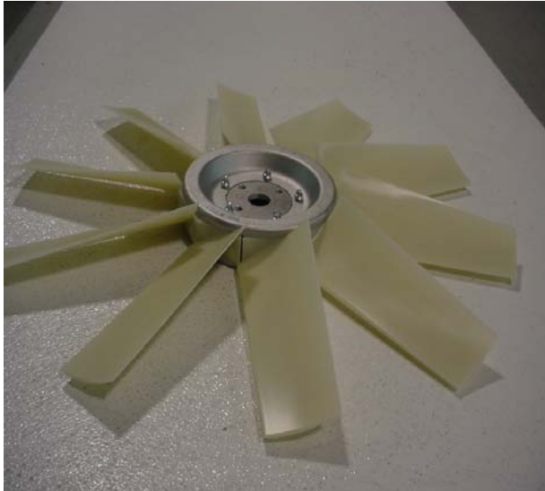
HASCON 10- WAY (FIXED PITCH FAN)