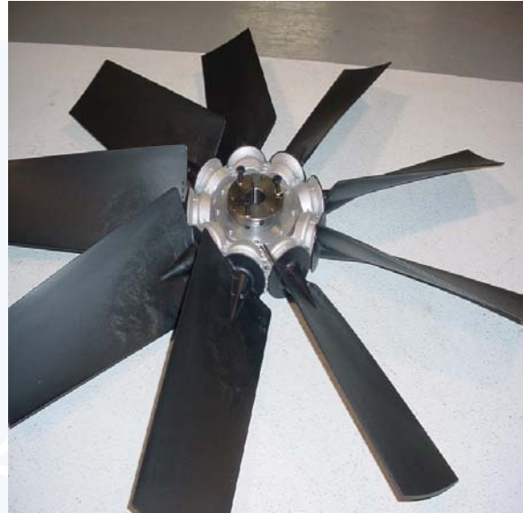
HASCON 9-WAY WITH SDS TAPERLOC