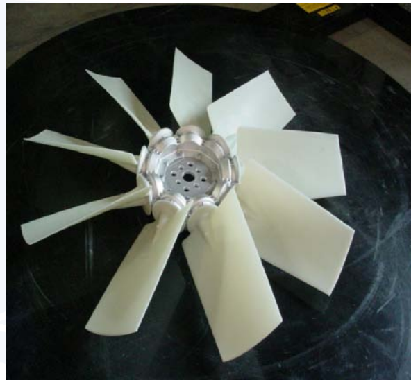
HASCON 9-WAY (ADJUSTABLE PITCH FAN)