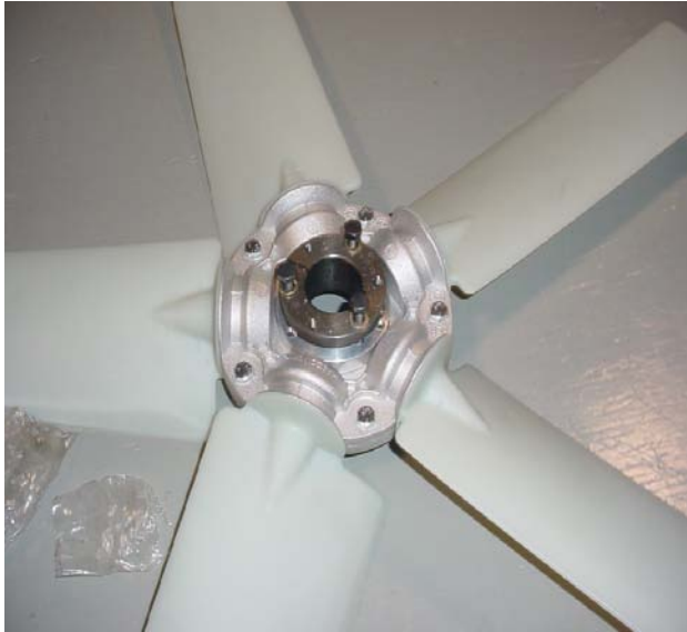
HASCON 5-WAY WITH SH TAPERLOC