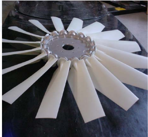
HASCON 16-WAY (ADJUSTABLE PITCH FAN)

IDEAL FOR OFF HIGHWAY VEHICLES AND STATIONARY EQUIPMENT SUCH AS AG TRACTORS, GEN SETS, SKID STEERS BACKHOES AND MORE.