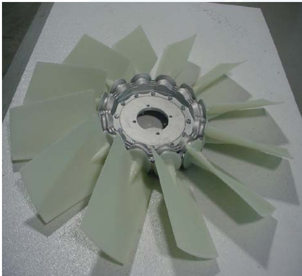
HASCON 12-WAY (ADJUSTABLE PITCH FAN)